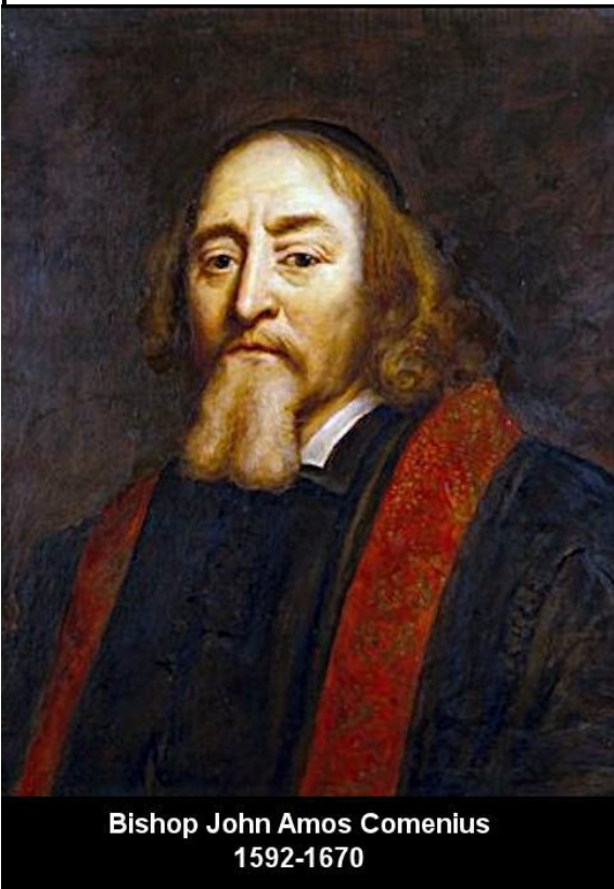
Bishop John Amos Comenius 1592-1670

By his example and pastoral care Zinzendorf quickened their Christian fellowship and united them for communal life under the Statutes of Herrnhut (May 12, 1727), which were found to follow the pattern of the old Unitas Fratrum. Through earnest and continued prayer, they realized more and more the power of the Cross of Christ in reconciling them one to another. A profound and decisive experience of this unity was given them in an outpouring of the Holy Spirit at a celebration of the Holy Communion on August 13, 1727.