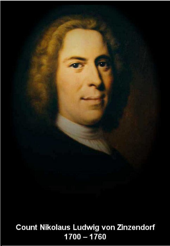
Count Nikolaus Ludwig von Zinzendorf 1700 – 1760

Between 1722 and 1727, some families from Moravia, who kept the traditions of the old Unitas Fratrum, found a place of refuge in Saxony, on the estate of Nicolaus Ludwig, Count Zinzendorf, and built a village which they called Herrnhut. Other people of widely differing views also found there a place of religious freedom, but their differences threatened to make it a place of strife. Zinzendorf gave up his position in state service to devote himself to unite these various elements into a real Christian fellowship. He became their spiritual leader, as well as their patron and protector against interference from without.